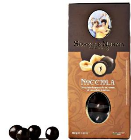
Hazelnut-Chocolate Praline $6.90