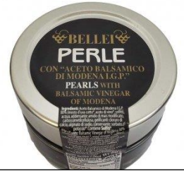
Balsamic Pearls 50gr $11.95

For much more items for your Christmas gifts, See our website Wholesale Catalog: https://www.villela-olio.com/simplyflavors-warehouse Some items are sold for retail. Come to see us. In December we are open for you each Friday from 2:00pm to 6:00pm