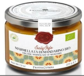
Tangerine Marmalade 225gr $6.99