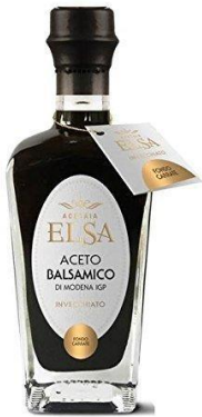
Balsamic 12 years aged $26.00

For much more items for your Christmas gifts, See our website Wholesale Catalog: https://www.villela-olio.com/simplyflavors-warehouse Some items are sold for retail. Come to see us. In December we are open for you each Friday from 2:00pm to 6:00pm