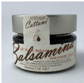
Aged Balsamic Jelly $16.90