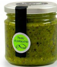
Sicilian Pistachio Pesto 129g. $12:99