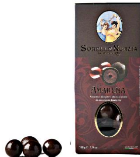
Amarena-Chocolate Praline $6.90