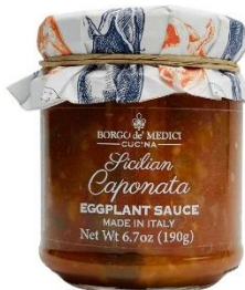
Eggplant Caponata from Sicily 190 gr $ 6.90