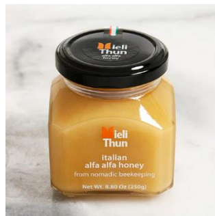
Honey Orange Blossom 250gr $9.90