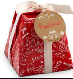
Classic Pandoro cake 1kg $28.00