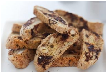
Biscotti Chocolate Orange $8.90