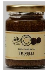
Truffle delicacies, with asparagus, artichokes, mushrooms, white asparagus etc. Come to see!