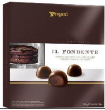
Chocolate Fondant $9.90