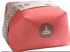
Sicilian Panettone 1kg $28.00